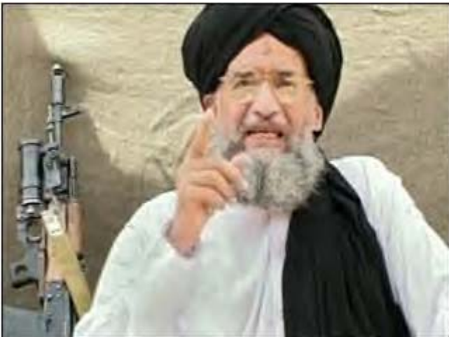
Ayman al-Zawahri, al-Qaida's second-in-command, speaks in a video aired by Al Jazeera.